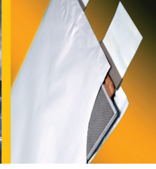
Head of role to role coater