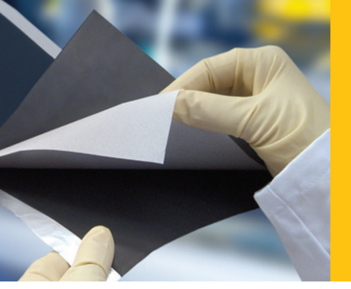
Examination of a lamination composite