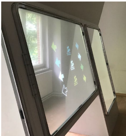
Experimental set-up for the project Smart Window